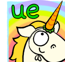
ue as in unicorn

Tap your chin like you're trying to remember something.