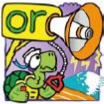
or as in tortoise