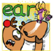
ear for earwig

Rest your finger on your cheek and point to your eye.