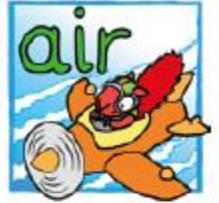
air as in aeroplane

Hide behind your arms, like an oyster's shell, then pop out!