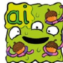
ai as in alien

Look through your binoculars and lean forward.