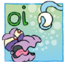
oi as in oyster

Twist the cap to free Urchin from the bottle.