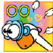
oo as in goose