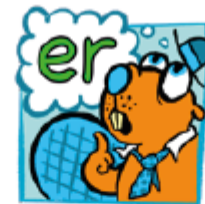
er as in beaver