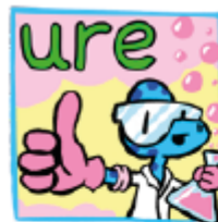
ure as in cure

Fly your hand through the air like an aeroplane.