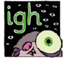
igh as in aye-aye