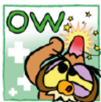
ow as in owl