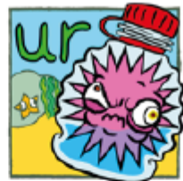
ur for urchin