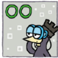
oo as in rook